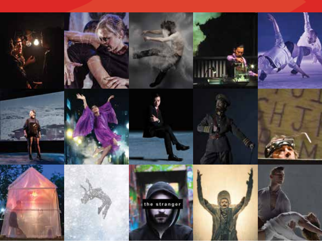
August 20, 2018 | CanadaHub, King's Hall, Edinburgh

Pitching new work by 15 of Canada's most exciting performing arts companies